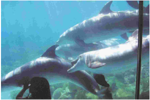
Even in 'refuge areas', underwater viewing walls ensure that the dolphins are never far from the sight or sounds of visitors.