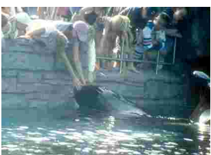
Orcas, too, can be subject to petting in public display facilities.

no alternative but to bring this issue to the attention of the public, the media and the travel and insurance industries. We encourage each to respond responsibly to the information provided.