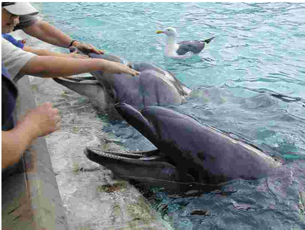
Several Petting Pool dolphins are obese, despite a legal obligation to adjust captive dolphins' food intake to ensure a "normal state of good health".

As Sea World explains on its website, its trainers use food as a 'primary reinforcer' to let an animal know when it has performed a desired behavior. In the case of unwanted behavior, the trainer remains motionless and silent for three seconds. But as the site acknowledges, "Because we really don't